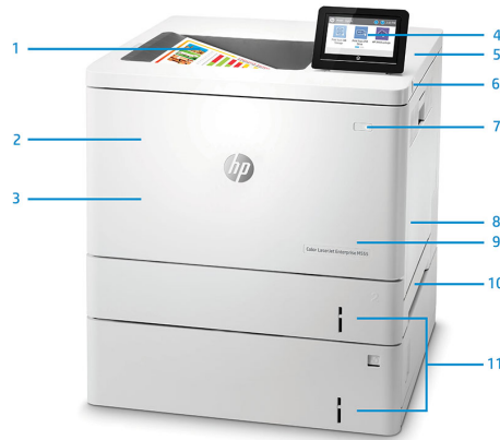
HP Color LaserJet Enterprise M555x shown