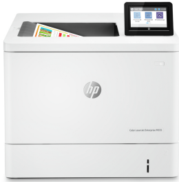
HP Color LaserJet Enterprise M555dn

HP's mid-level Enterprise-class color printer with speeds up to 38 ppm 8 and strongest security. 2