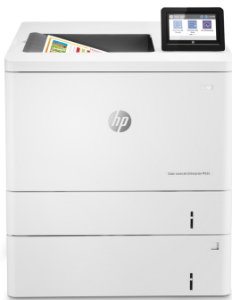
HP Color LaserJet Enterprise M555x