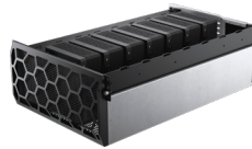
Hypershelf for Precision 3280

Elevate your video conferencing experience on this powerful, intelligent 4K webcam that optimizes your visuals with a large 4K Sony STARVIS™ CMOS sensor and AI Auto-Framing.