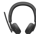
Dell Wireless Headset | WL3024

Create an unequalled 3D navigation experience with the most ergonomically designed product 3Dconnexion has ever created.